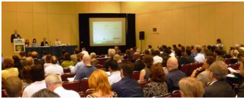
Table top by the Breakout entrance... Logo on event

signage and screen, literature distribution opportunities; VIP admissions (10 excl./5 non